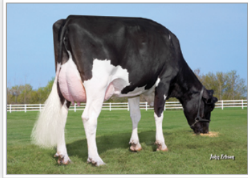
Line-View Roland 207