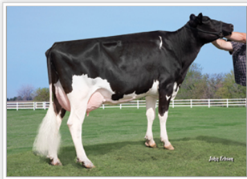
Line-View Roland 207